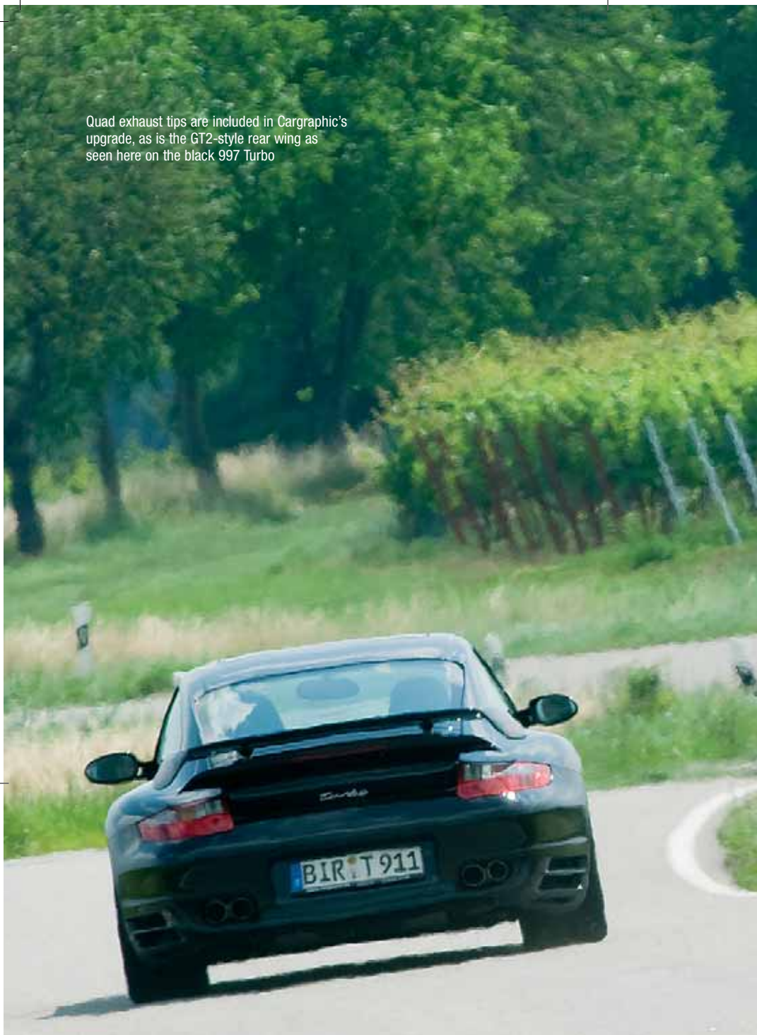
Quad exhaust tips are included in Cargraphic's upgrade, as is the GT2-style rear wing as seen here on the black 997 Turbo

Unlike mainland Europe, the US and the Middle East, the average British Porsche driver just doesn't get the mega horsepower thing. Whether this is due to the expense involved or the fact that over here there really isn't that many opportunities to deploy the power that a standard 911 comes with, let alone any more, is hard to tell.